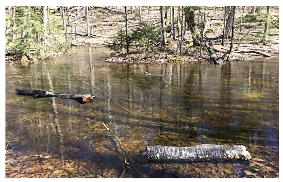
Vernal pool.

Vernal pools are small, temporary wet areas that are frequently found in the Maine woods. These pools are created in small depressions, by melting snow and rain in the spring, and often dry up by late summer. They don't contain fish, which makes them ideal for frogs and salamanders to lay their eggs (which fish like to eat). Because these amphibians are a vital part of the food chain, it is important to protect vernal pools when working in your woods.