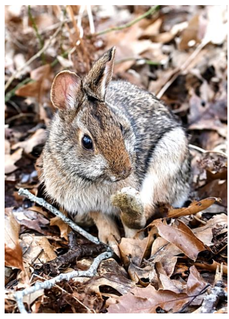
New England cottontail.

A list of rare plants can be found on the Maine Natural Areas Program website at https://www.maine.gov/ dacf/mnap/features/rare_plants/index.htm.