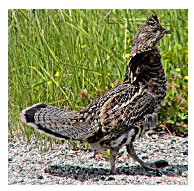
Ruffed grouse.

Viewing, enjoying, and providing wildlife habitat are the most important goals of many woodland owners. Some are avid birdwatchers and know every species of warbler that arrives in May. Some enjoy spending fall mornings in a deer stand or walking trails for grouse. Others listen for the chorus of wood frogs and peepers on rainy spring evenings. Whether you're a long-time wildlife watcher or just beginning to identify common species, improving your woods for wildlife can be fun and rewarding.