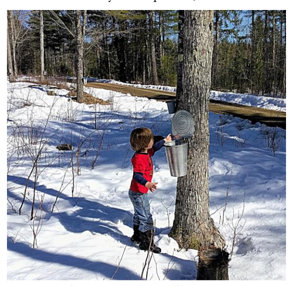
Collecting sap.

To produce syrup, boil raw sap until it has the desired