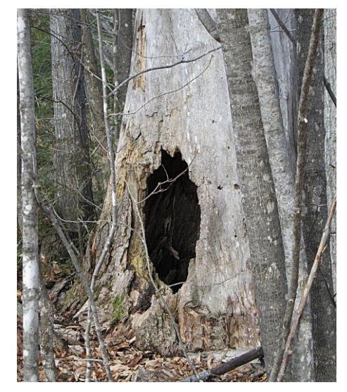
Cavity tree.

Maine. Woodpeckers, chickadees, and other birds pick insects out of the decaying wood, and bats often roost under loose bark. Some snags have hollow centers that serve as nesting sites for owls, squirrels, and other animals. In addition, dead trees and woody material on the forest floor provides essential habitat for many small mammals, birds, and amphibians. As snags and downed woody debris decompose, they add nutrients to the soil and encourage new plants and trees to grow. Many tree seedlings start on rotting logs in the nutrient-rich decaying wood.