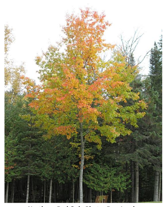
Northern Red Oak.

1. Move your tree to the planting location, and remember trees are not 2x4's. Lift or carry your tree by its root packaging, most likely a planting pot, rather than by its trunk or branches. Once at the