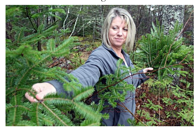
Collecting wreath brush.

the beginning of November when the trees are dormant. Needles that are mostly flat are preferred for wreaths. Fortunately, these types of needles are often found on branches that are within five feet of the ground. When gathering brush on cold days, the tips of