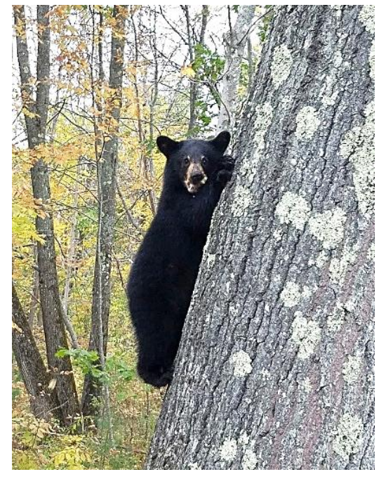
Bear eating an apple while climbing an oak tree.

Mast trees and shrubs are very important habitat features. They produce fruits, nuts, seeds, and berries eaten by wildlife. Oak, beech, pin cherry, birch, serviceberry, nannyberry, winterberry, hawthorn, and dogwood are good examples of mast species common to many woodlands. Some wildlife, like turkeys and black bears, rely on mast for a large part of their diet—especially when they're putting on fat for the winter. The healthier the tree or shrub and the more resources it gets, the more mast it will produce. Therefore, mast species can be encouraged to produce more food with proper pruning and by removing nearby trees and