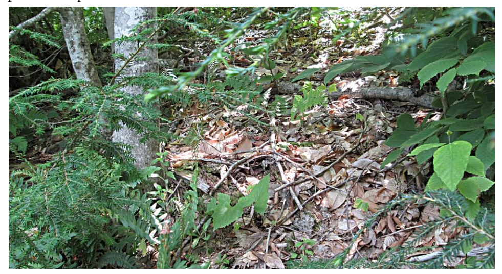
Leaf litter.

As you explore your woodland, you will find many other features that provide important habitat for wildlife.