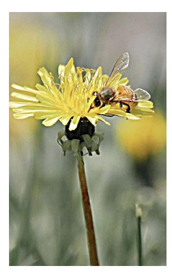
Honey bee, ruby throated hummingbird, and eastern tiger swallowtail butterfly.

existing mast sources to increase the food supply. Further, planting native nectarproducing flowers and shrubs around your yard will attract hummingbirds and butterflies. In short, there are many ways to increase the amount and diversity of wildlife on your property.