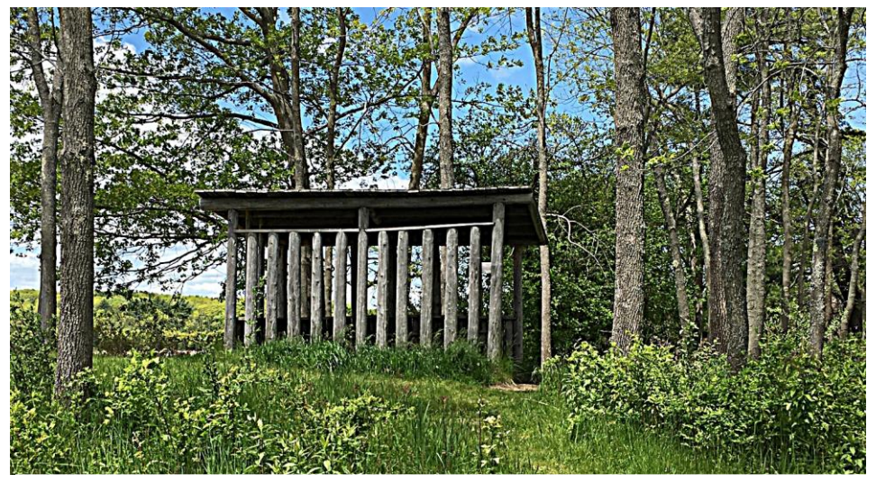
Wildlife blind.

structures can range from extremely simple to very elaborate. How much time and effort you put into creating a blind is up to you. For more information about wildlife blinds, visit the Audubon website and check out the great article on this topic at https://www.audubon.org/magazine/summer-2017/windows-another-world-take-tour-bird-blinds.