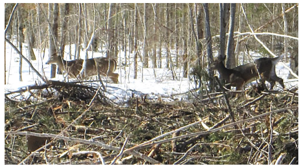
White-tailed deer.

Space is the area that supplies an animal with food, water, and cover. The amount of space an animal requires varies from species to species. Generally, large animals need larger areas. In addition, many animals move from place to place throughout the year. Some, like white-tailed deer, go only a short distance to find more cover in the winter. Others, like Maine's migratory birds, travel thousands of miles on an annual basis.