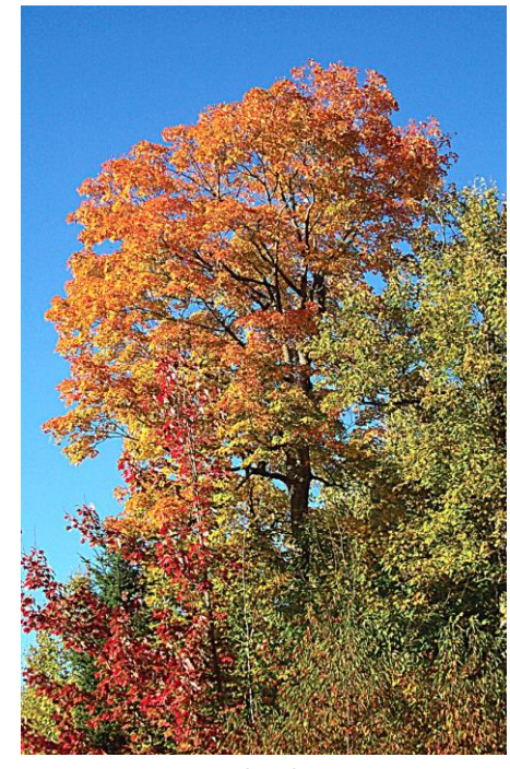
Sugar maple.

The raw ingredient of pure maple syrup is sap from maple trees. Although sugar maples are preferable for their higher sugar content and other attributes, the sap of red maples will suffice. For personal use, 12 healthy trees will probably produce 2 plus gallons of syrup per year. A small commercial operation requires at least 1 or 2 acres stocked with 50 to 75 maple trees on each acre.