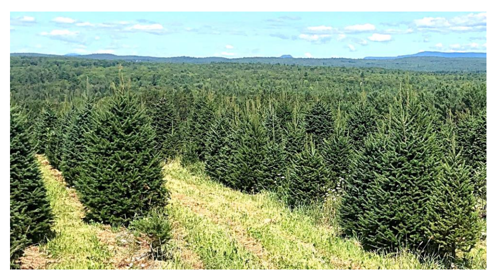
Christmas trees.

To guarantee that you have trees ready for harvest year after year, it is important to stagger your planting. In other words, plant some trees each year for several successive years. It is also prudent to plant a few extra trees each year to compensate for those that do not survive.