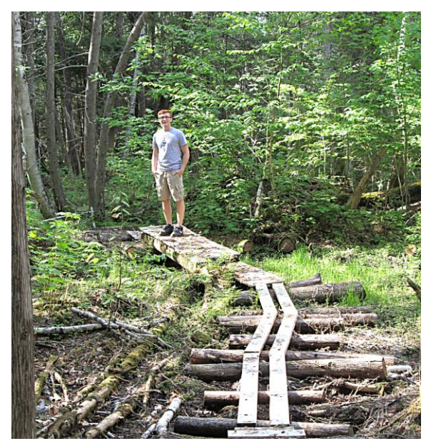
Walking trail.

The following are some tips to consider when planning a trail: