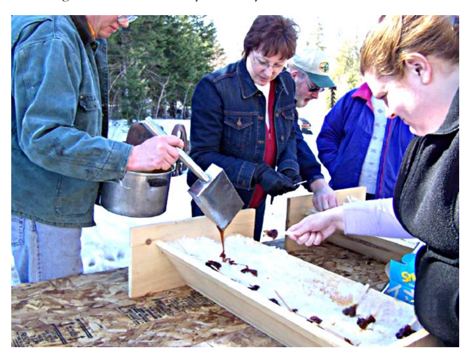
Making maple taffy.